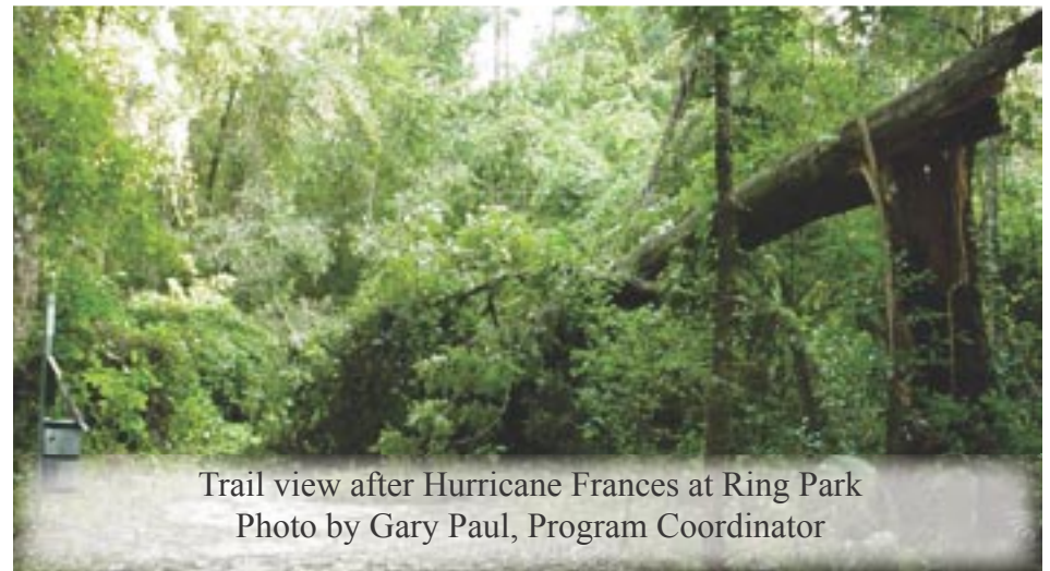
Trail view after Hurricane Frances at Ring Park

For information on park re-openings visit www.natureoperations.org