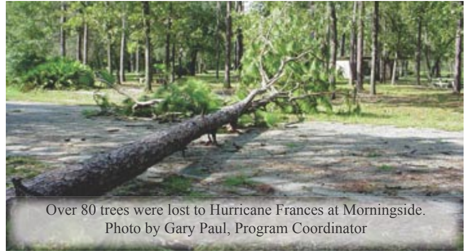
Over 80 trees were lost to Hurricane Frances at Morningside.

A visit to any of your nature parks will show just how badly these renovations and improvements are needed. These projects will not be possible without this funding source. This funding will allow us to apply for grants that require a match enabling us to get more power out of every penny. Visit www.betterparksbetterroads.org for project listings.