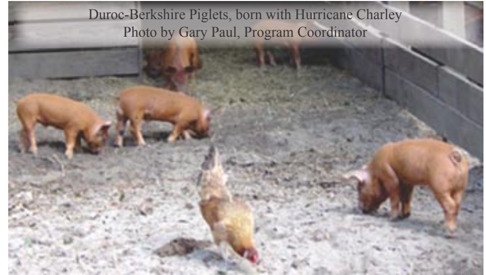
Duroc-Berkshire Piglets, born with Hurricane Charley

For more information, call us at 334-2170 or visit www.natureoperations.org