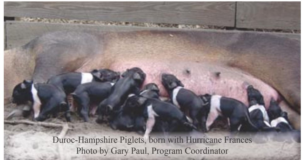
Duroc-Hampshire Piglets, born with Hurricane Frances

The Living History Farm is re-opening on October 30th for Living History Days every Saturday from 9am-5pm. Interpreters in period dress will bring alive 1870’s farm life for you and your family. Sample biscuits hot from the woodstove with homemade butter and cane syrup grown and made on the farm. Come and see the two new litters of piglets and let the kids help with feeding at 9am or 4pm. Many other hands-on opportunities are available. For more information please contact us at (352)334-3326 or visit www.natureoperations.org for ongoing calendar of events.