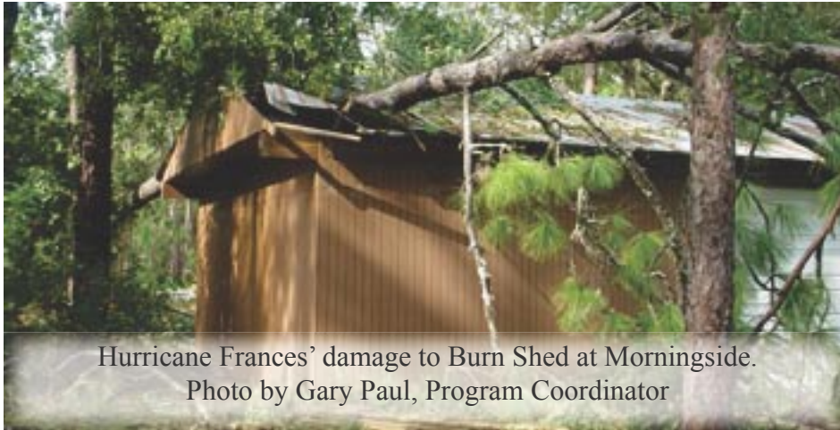
Hurricane Frances' damage to Burn Shed at Morningside.