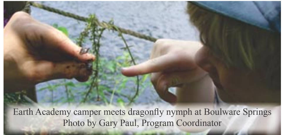
Earth Academy camper meets dragonfly nymph at Boulware Springs