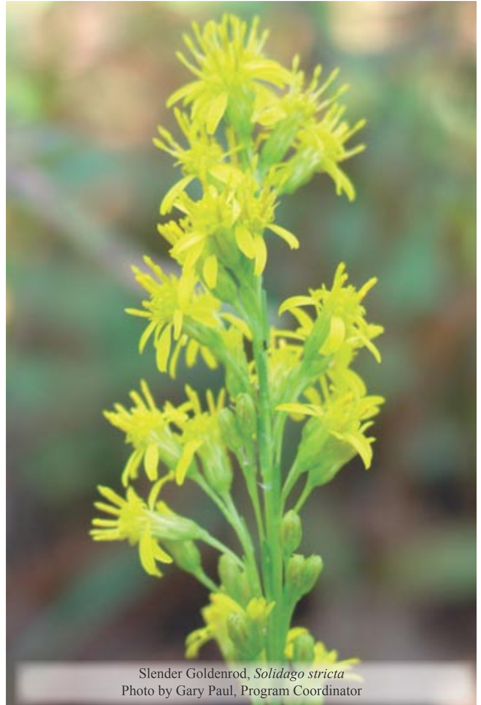
Slender Goldenrod, Solidago stricta

For more information, call us at 334-2170 or visit www.natureoperations.org